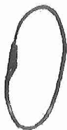
1 narrow elliptic