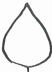
2 triangular to circular