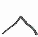
3 short acuminate