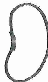
4 kidney shaped