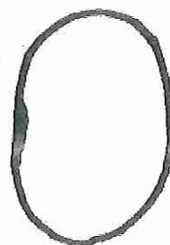
3 broad elliptic