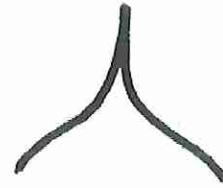
7 long acuminate