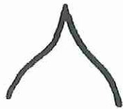
5 medium acuminate