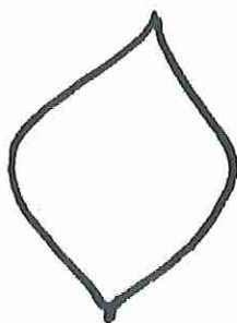
4 circular to quadrangular