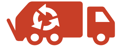
Figure 2: Possible destinations of side-streams that do not end up for human consumption