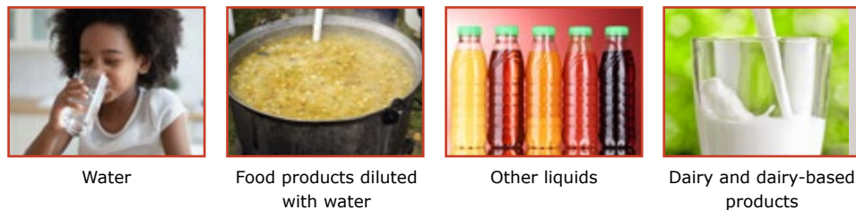
Figure 4: Different types of drinks and liquids

The applied FLW definition in this project (FAO 2019) mentions specifically that FLW includes drinks and any substance used in the manufacture, preparation or treatment of food.