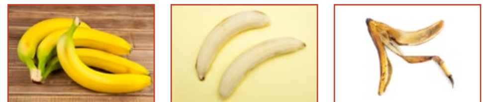
Edible + inedible parts of banana

The applied FLW definition for this project (FAO 2019) only includes the edible fraction of food as part of FLW.